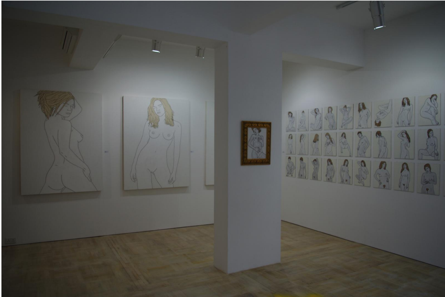
Jonathan Thomson White Girls Korkos Gallery Hong Kong 2010 Installation View