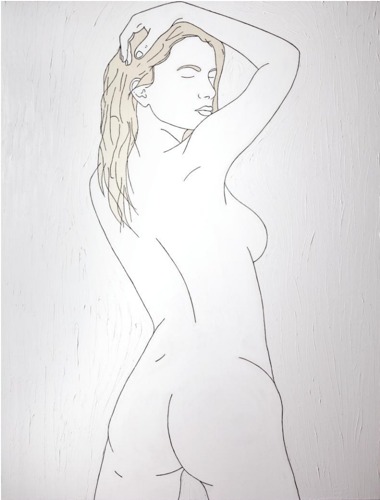
Jonathan Thomson Large Nude 12 2008 Oil and Gesso on Canvas 160 x 120 cm