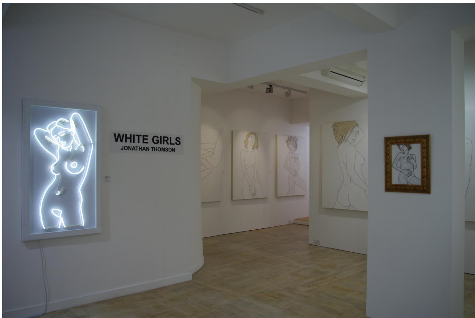
Jonathan Thomson White Girls Korkos Gallery Hong Kong 2010 Installation View