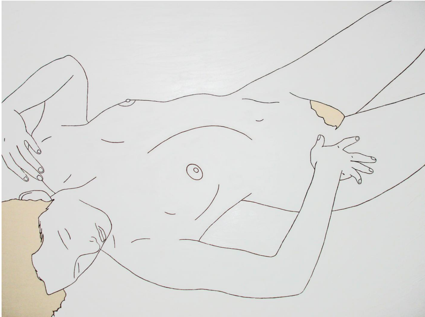
Jonathan Thomson Large Nude 4 2008 Oil and Gesso on Canvas 120 x 160 cm