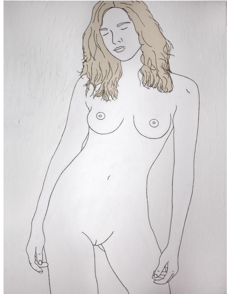
Jonathan Thomson Large Nude 9 2008 Oil and Gesso on Canvas 160 x 120 cm